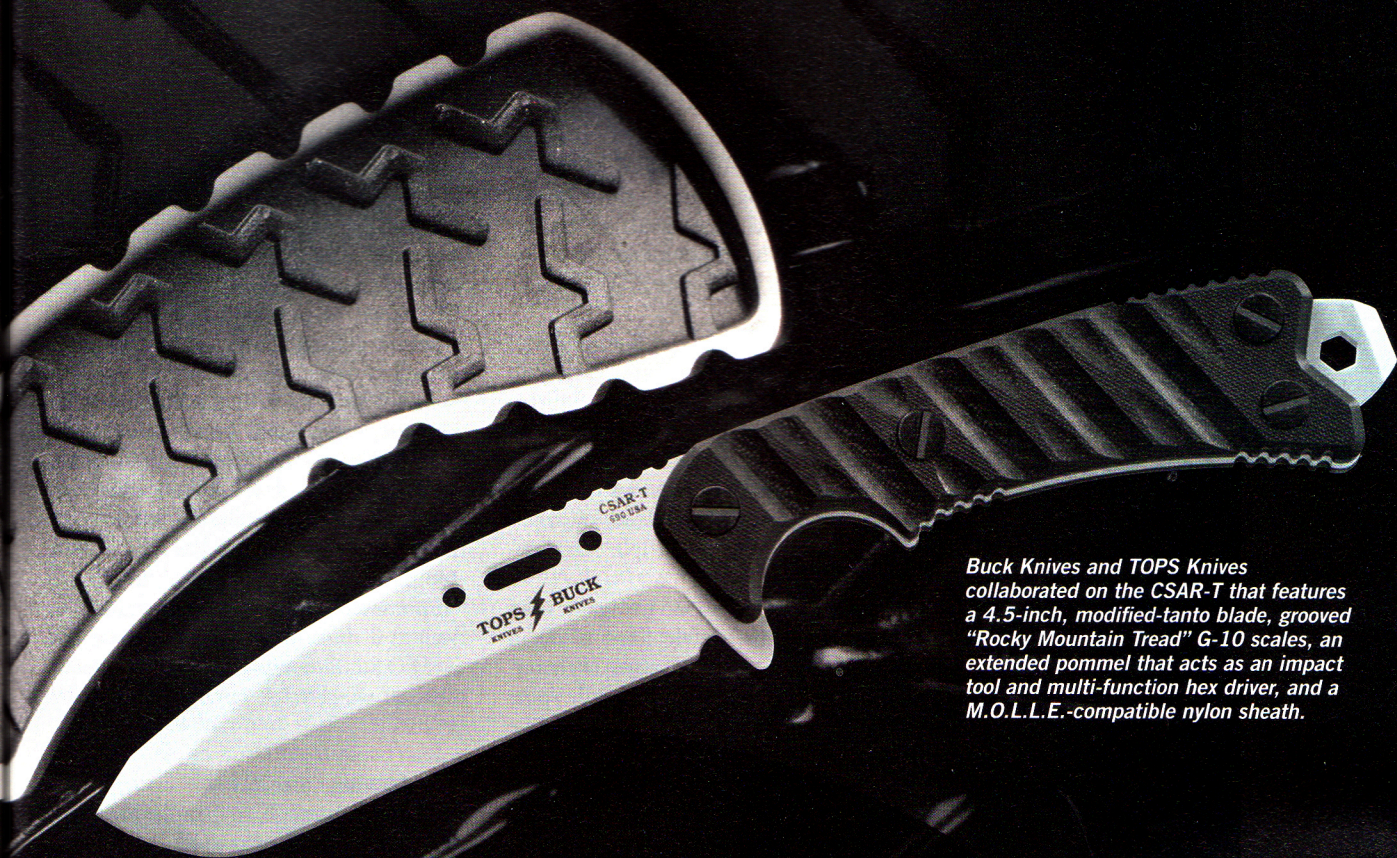
Buck Knives and TOPS Knives collaborated on the CSAR-T that features a 4.5-inch, modified-tanto blade, grooved "Rocky Mountain Tread" G-10 scales, an extended pommel that acts as an impact tool and multi-function hex driver, and a M.O.L.L.E.-compatible nylon sheath.

T ell all your fixed-blade friends they don't have to be weighted down by clunky, heavy straight knives anymore. The newest in the non-folding tactical genre are refreshingly light, maneuverable, safe and sound. So accept a tactical upgrade and let the knife do the walking and talking for you.